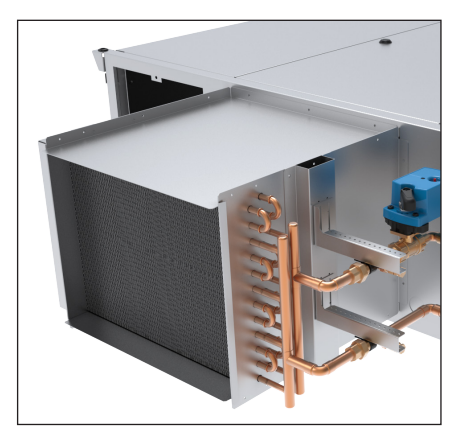
Optional hot water coil with on/off, incremental, or proportional controls.