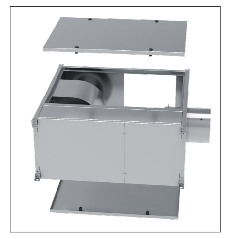
Top and bottom service panels allow for quick motor and blower access.