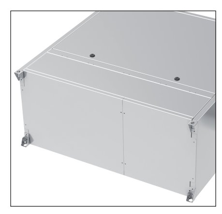
Standard Integrated 180-degree flippable control enclosure and vibration isolating hanger brackets.