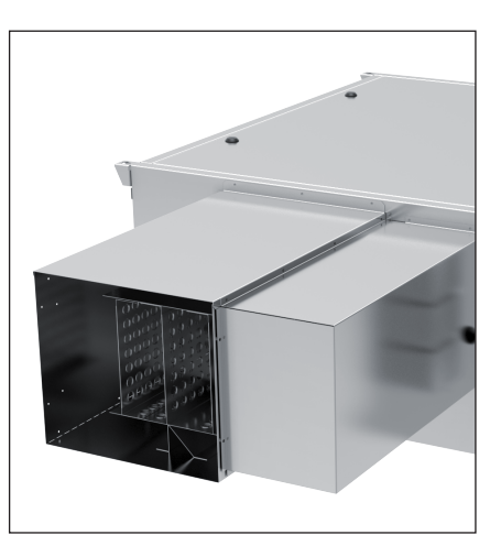
Optional duct-mounted staged or proportional SSR electric heat.