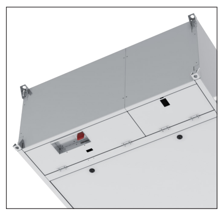
Hinged NEC bottom access doors with externally-mounted Solo/Sync motor control.